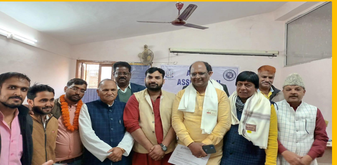
Team MCR Alumni of Marwari College, Ranchi