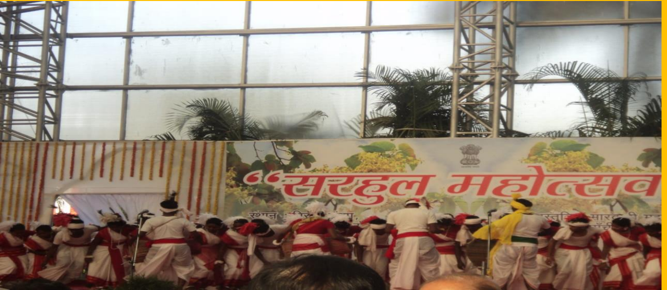
Sarhul Mahotsav celebration