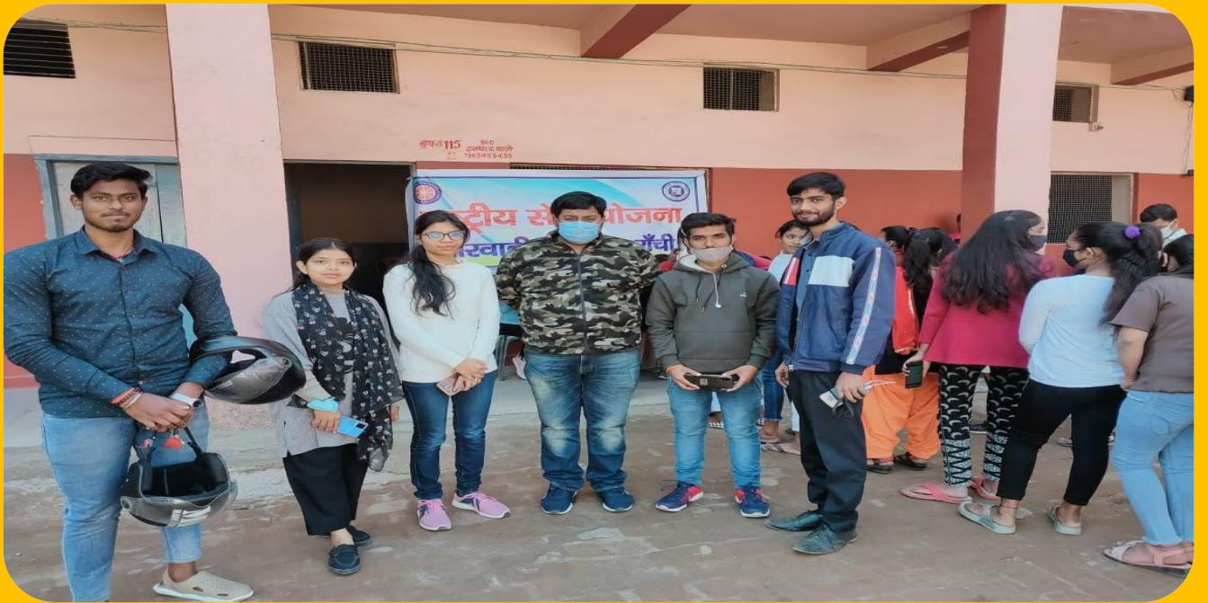
NSS team organizing COVID-19 Vaccination Drive